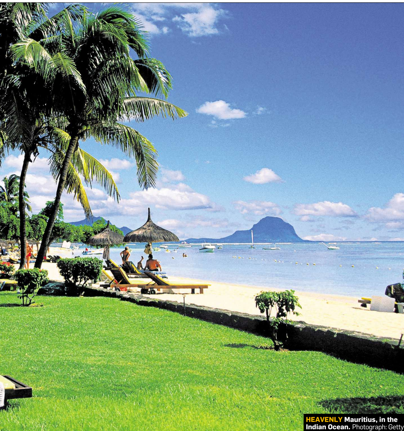
HEAVENLY Mauritius, in the Indian Ocean.

Honeymoon's over for honeymoon testers: P14