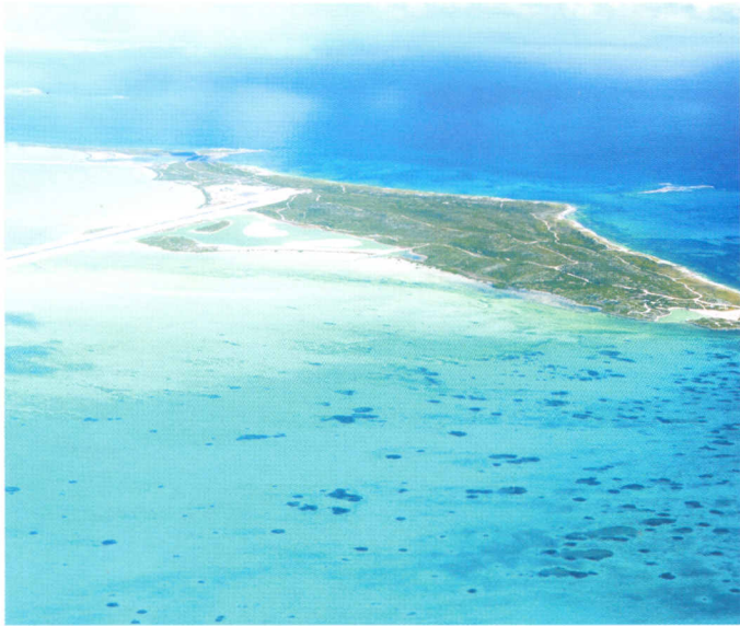
TURKS & CAICOS