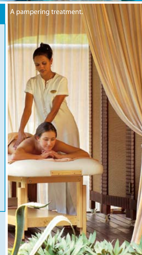
A pampering treatment.