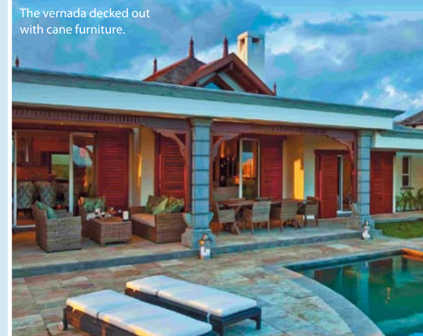
The veranda decked out with cane furniture.