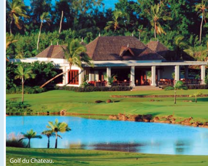
Golf du Chateau.

Garden and Home was a guest of Les Villas de Bel Ombre, Villas Valriche and Le Telfair Golf & Spa Resort, ferried around by Mautourco, www.mautourco.com , and flown comfortably to Mauritius courtesy of Air Mauritius, www.airmauritius.com or call 011 394 4548 or 011 394 4549. GH