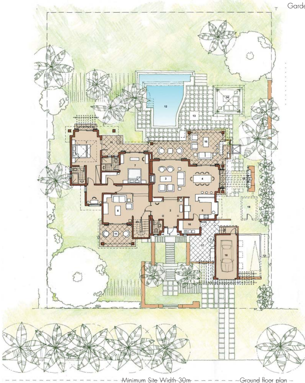
Minimum Site Width-30m - Ground floor plan -